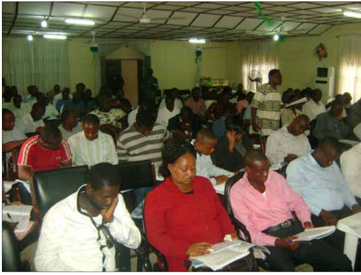
25<sup>TH</sup> International Conference On Solid Waste Technology & Management Philadelphia, Pennsylvania USA March 14th - 17th 2010

Below are some of the prospective members of the Nigerian Society of Engineers during a 3-day refresher course which held in NSE PH Branch secretariat from 17th to 19th March 2010.